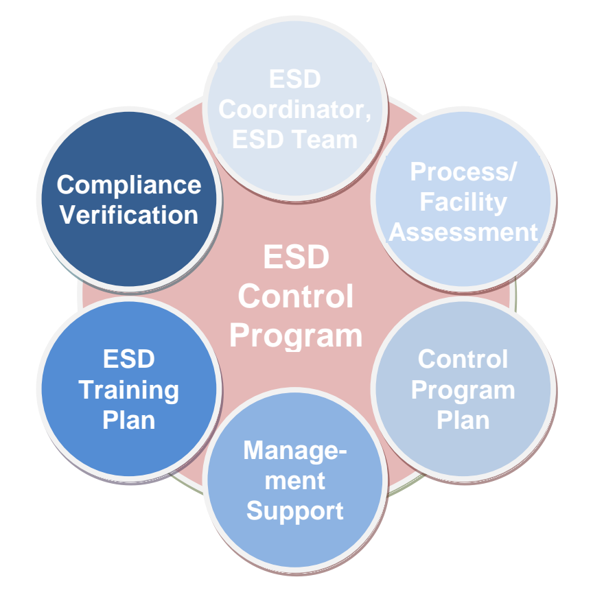
Figure 2: Six critical elements of a successful ESD control program